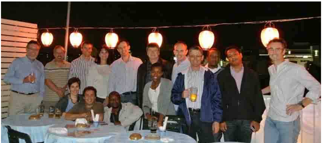
South African delegation enjoying Japanese food