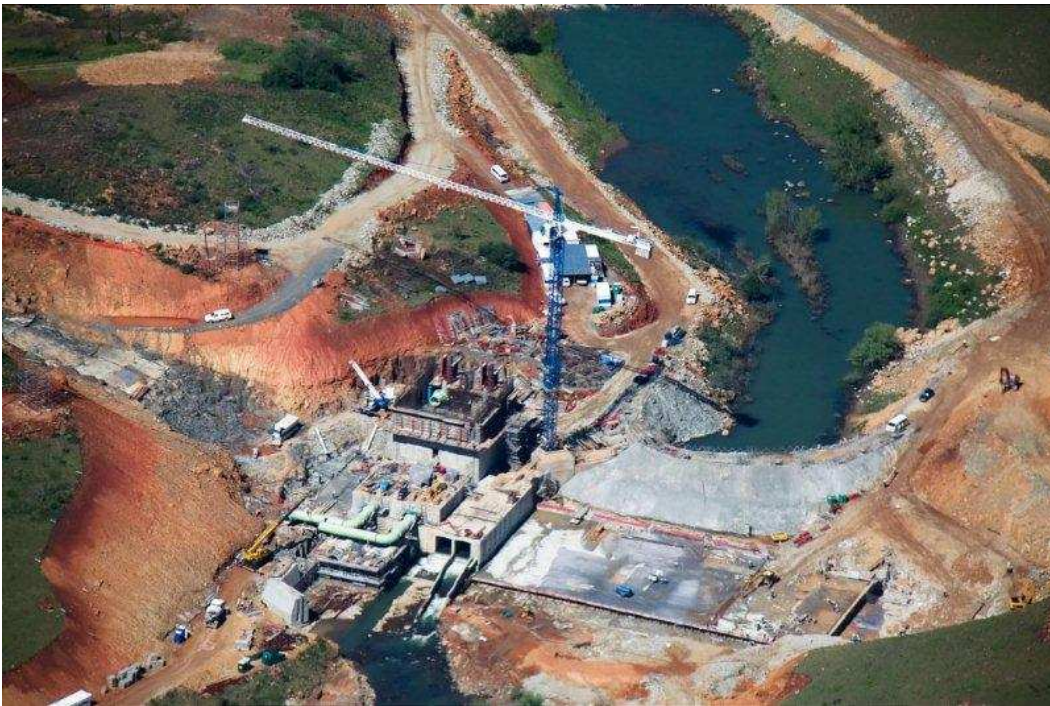
Spring Grove Dam under construction

The organisation of this Course and associated site visit to the RCC Spring Grove Dam which is under construction is well underway. The course will earn you CPD points. The theme of the course will be on Advanced technologies for construction of dams and environmental considerations during implementation . Course details have already been circulated to SANCOLD members and are available on the website. We already have 100 persons who have registered for the event. Book early to avoid disappointment!