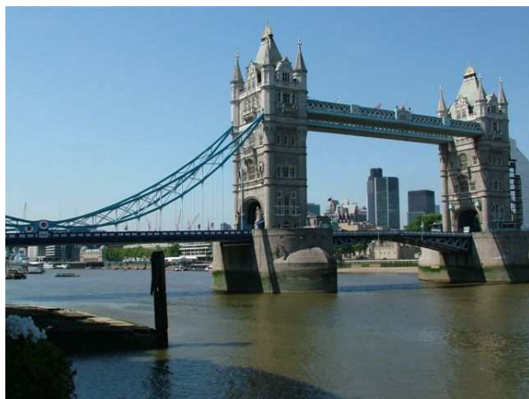
Tower Bridge: London's favourite landmark

My wife and I went to the UK (last time without a visa) during June/July primarily to attend a wedding of a nephew. This time I did not plan to visit any dams, but saw several interesting sights which relate indirectly to dams! We visited Tower Bridge and had a steep climb up to the walkway where they have an excellent exhibition. The bridge construction was started in 1886 following a competition on various designs. The Bridge was opened in 1894. We also visited the engine room with the wonderful steam engines which have now been replaced by a hydraulic system powered by electric motors. What impressed me was the care of the Victorian Engineers in the design and construction of this major work. Aesthetics and durability were obviously most important. The bridge has undergone reconditioning several times during its lifetime. Further detail is available on www.towerbridge.org.uk