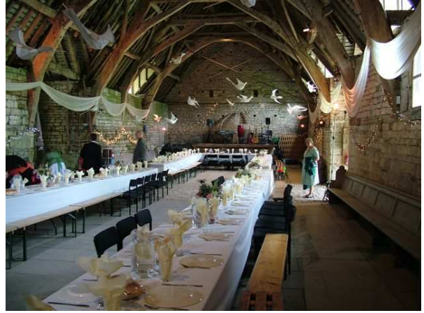
Postlipp Tithe Barn dating back to 1 150 AD

During our walks around London we came across work by Thames Water on the replacement of 100-year old Victorian water distribution piping. The leakage levels are now too high and plastic pipe is being used as a replacement. I asked the workers (during their tea break!) whether the new pipe will have a similar lifetime or not and their reply was that it did not concern them as they would not be around! Finally we had a wonderful wedding reception in an 860 year old barn. The wooden trusses and stonework are still in excellent condition. The barn had clearly been maintained and renovated at various times.