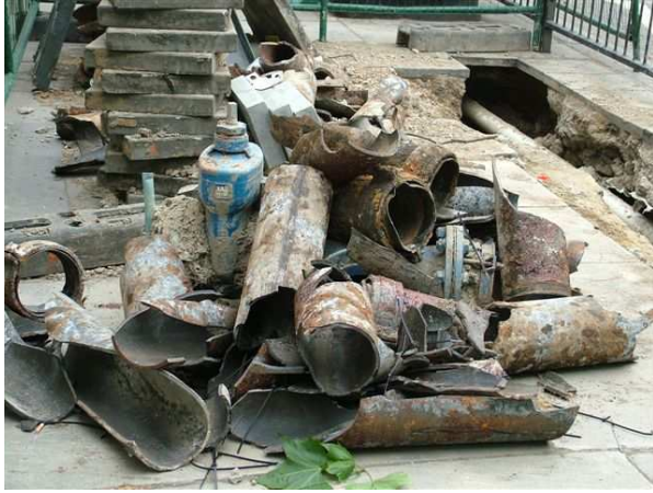
100 year old Victorian cast iron pipe in London