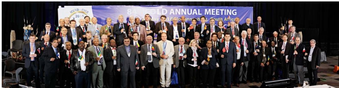
84 th ICOLD General Assembly

The General Assembly is shown in the following Photograph: